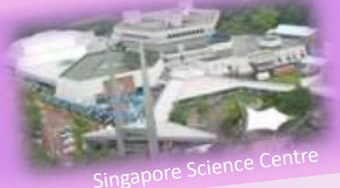
Singapore Science Centre